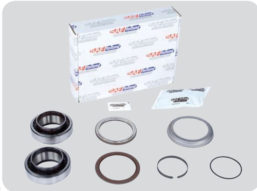
Fig. with exciter ring